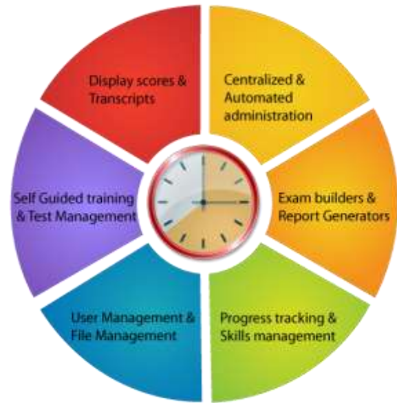
Figure 2: Need for Knowledge

We are facing difficulties for finding the proper definition of knowledge. While we can speak about knowledge i.e. KNOWLEDGE is that which a person comes to believe and value on the basis of the systematic organized accumulation of information through experiences, communication as inference and another any insight into knowledge can be regarded as knowledge itself. Today knowledge management system is very essential for any organization and institute for staying in global market. Many it companies also adopt the knowledge management system . In the present era we have a lot of new information and little time to learn it, so we need knowledge management system. This tool helps us access information very fast. At the end, we are capable to better deal with our customers' projects. Knowledge management is not only necessary for managing of knowledge , rather then it is also useful in knowledge era. Each organization knows the power of information. The main competition in the market between companies is that knowledge representation by employee. Knowledge management